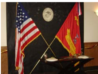
Adapt and overcome! Low ceilings required innovation.

Commandant's note: My intent during this blitz is to focus the efforts of all members towards membership during a typically slow time of year for us. This is the time of year when people are most likely to join an organization because of "cabin fever". I challenge everyone to sign up just one member.