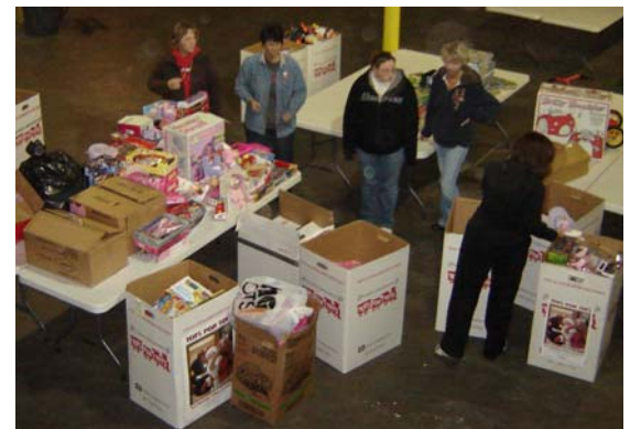
12 November 2009— First working party of the year unpacks items from storage

The final TFT working party will be held in conjunction with the regular December meeting of the Detachment. See related article on page 5.