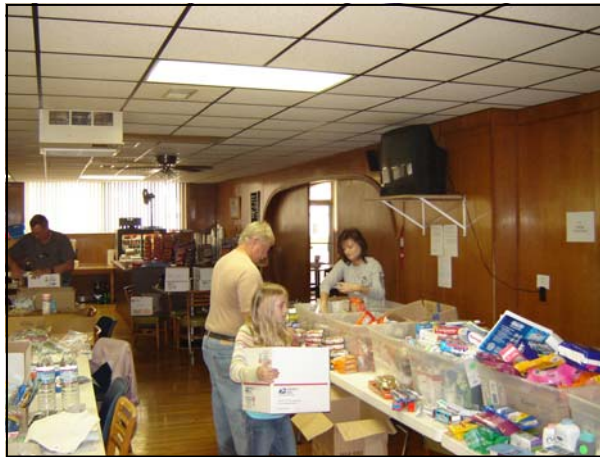
14 November 2009—Sorting the goodies prior to packaging helps to ensure that all care packages are complete.