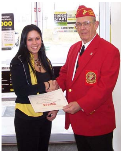
Certificates of Appreciation were given to sponsors such as the Northside Dollar General Store in Jasper

"Our membership numbers had increased by over 30% for the year, not including the six (6) new members voted in at the January meeting"