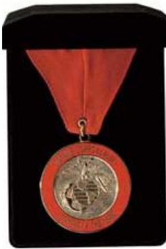
Detachment Marine of the Year Medal

"We simply cannot afford to allow these good people to fade away into the sunset, but rather must increase our efforts to regain, and retain each and every one."